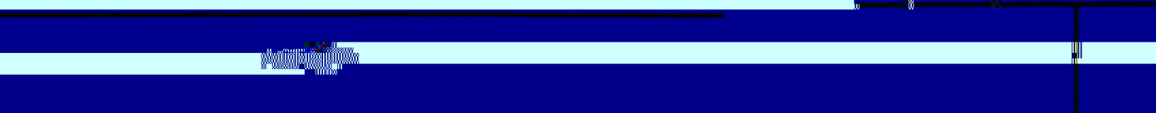
1. Aerial photograph of the building complex.

2. Aerial photograph of the building complex.