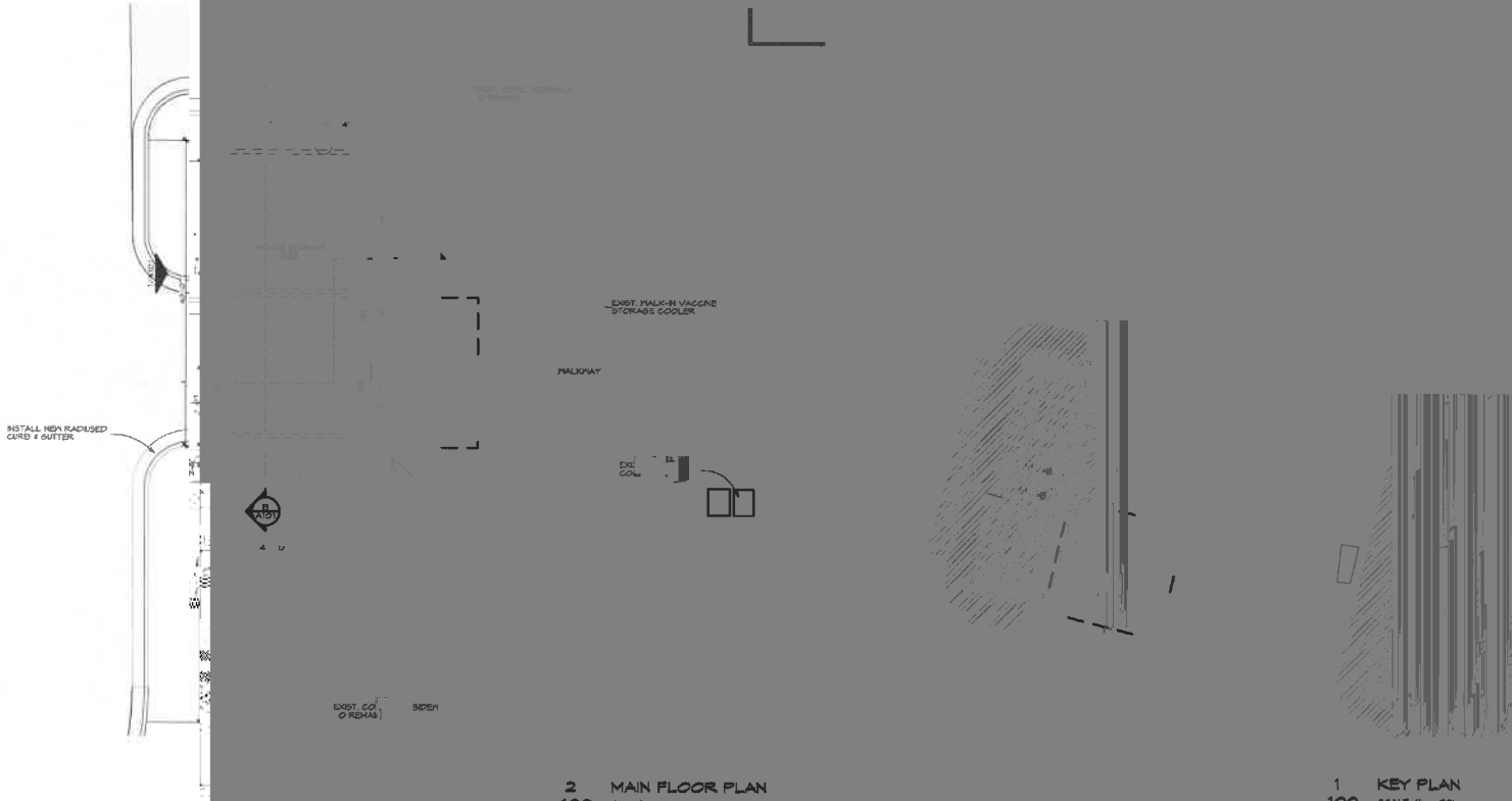
2 MAIN FLOOR PLAN 100 SCALE: 1/8" = 1'-0"